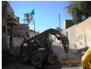
(Above) 2 BSTB Engineers break through the concrete