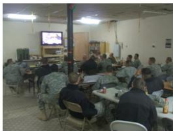
(Above) Soldiers watch the Bears beat the Saints in the NFC Championship game