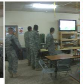
(Below) Soldiers watch the Colts win the AFC Game