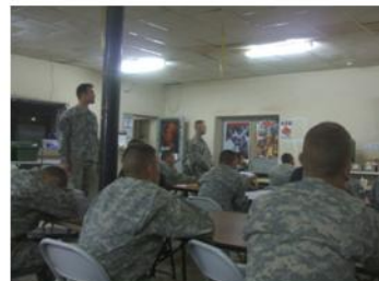
(Above) Getting into the games