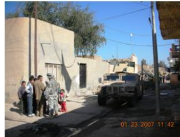
(Above) 413 CA Team 3 gather the mood of the people while in Yusufiyah