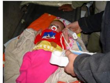
(Above) Checking the child's vital signs