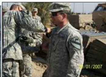
(Above) An A/2-5 CAV soldier receives his combat patch