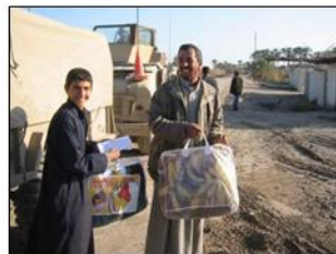
(Above) A happy father and son with their blankets

On the afternoon of 18 January 2007, 4/4/6 IA and A/2-5 CAV conducted a mission to the communities of Mulla Fayad, Arab Jasim and Al Taqa. The mission was to distribute blankets and Tippline flyers to the local population. The Tippline connects the public to the IA and CF to allow them to report any terrorist acts without repercussion. The residents in each area were pleased to receive the gifts from the