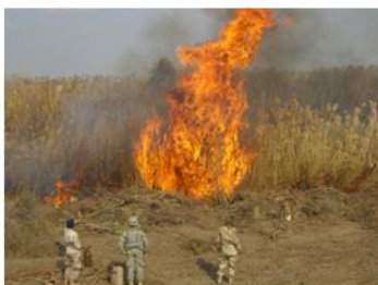
(Above) A/4-31 and 4/4/6 IA soldiers burn reeds around CP 155