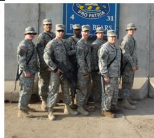
(Above) The 442nd Quartermaster soldiers with their combat patches