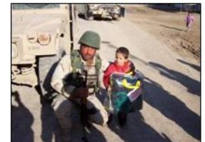
(Above) An Iraqi Army soldier gives a blanket to a little boy