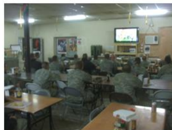
(Above) Some soldiers stayed up all night to watch both games