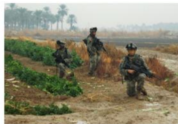
(Above) Members of C/4-31 patrol their sector

they distributed blankets and schools supplies to the people in the area, building a good relationship and making many friends in their portion of the Polar Bear AO. The company has also detained numerous individuals in