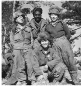
AD072-HILL 605-STICK-7TH ROK INFANTRY-NOV.1951