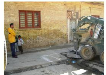
(Above) The Yusufiyah Water minister supervises the 2 BSTB ENG