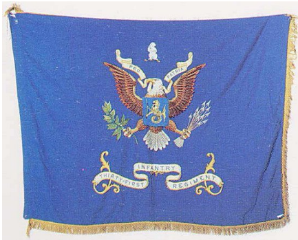
31 st Infantry Regimental Colors in Korean War Museum, Beijing